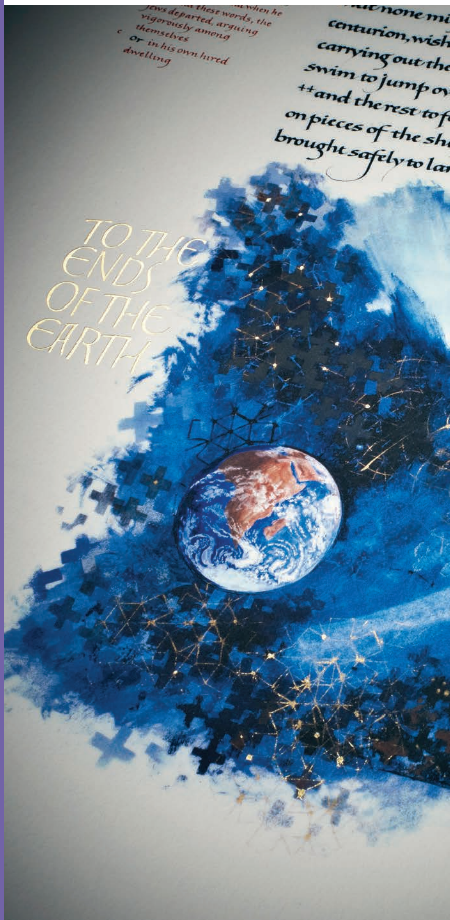
All of The Saint John's Bible illuminations and images shown on these pages are the property of Saint John's University, Collegeville, MN, USA. Copyright 2018. Unauthorized use is prohibited. All rights reserved.